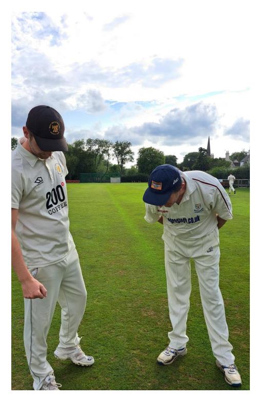
The coin toss....