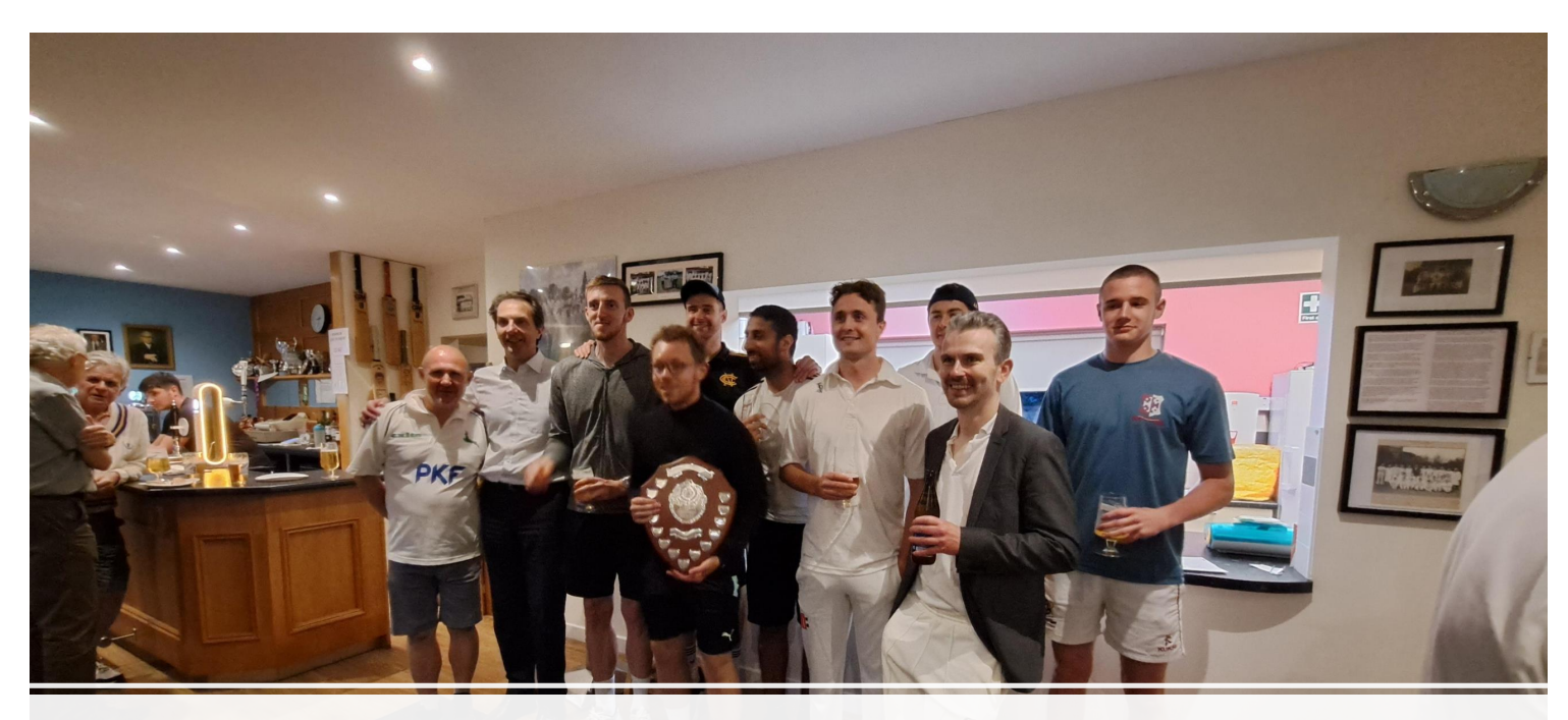
Derby & District Law Society – Battle of the A52 Cricket Team Winners 2023