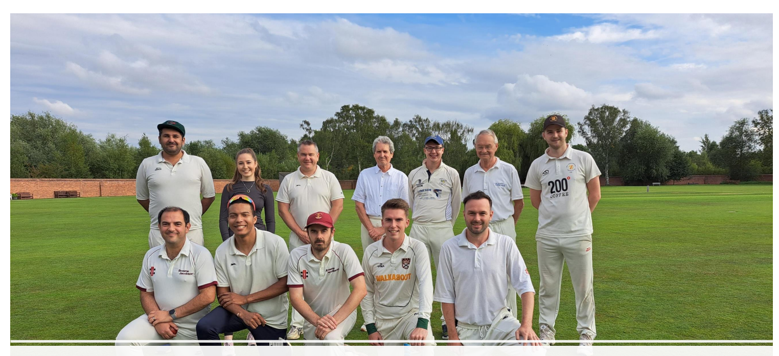
Nottinghamshire Law Society – Battle of the A52 Cricket Team