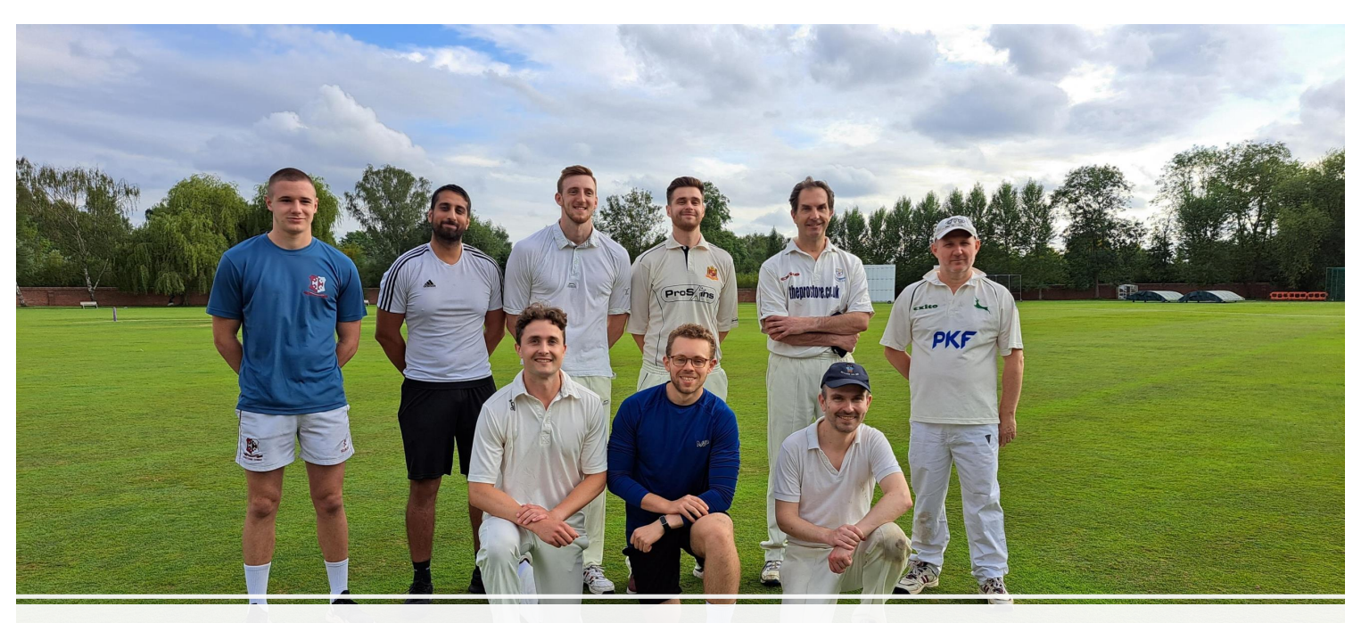
Derby & District Law Society – Battle of the A52 Cricket Team